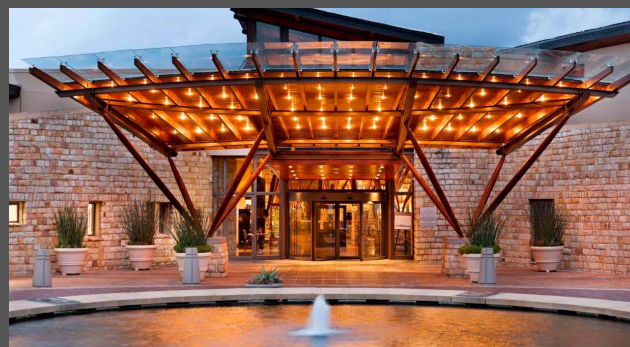
Arabella Hotel, Golf & Spa